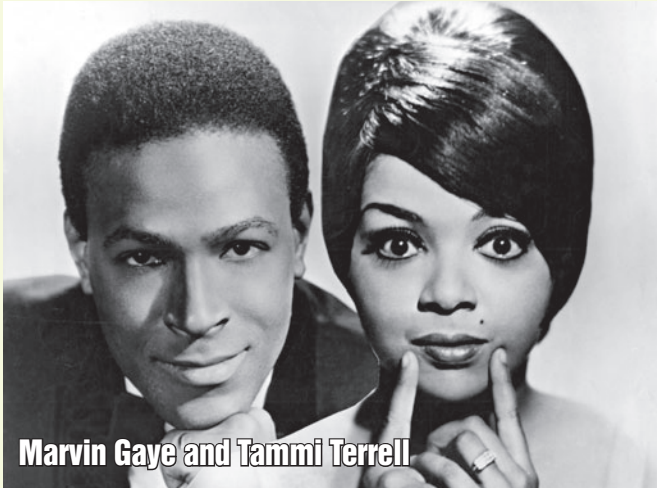
Marvin Gaye and Tammi Terrell